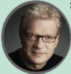
Sir Ken Robinson , Speaker and Author

An internationally recognized leader in the development of creativity, innovation, and human resources, Robinson works with governments in Europe, Asia, and the United States, and with international agencies, Fortune 500 companies, and some of the world's leading cultural organizations.