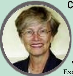
Carol Bellamy , President and CEO, World Learning